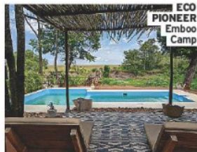
ECO PIONEER Emboo Camp