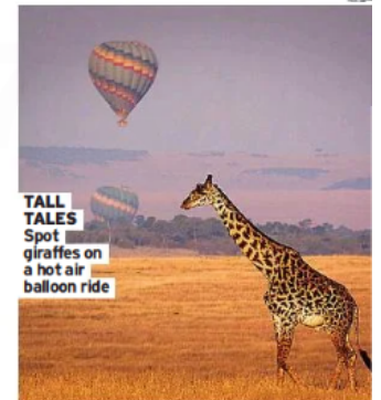
TALL TALES Spot giraffes on a hot air balloon ride

animal encounters, nothing beats a sundowner in the bush. Cold beers taste so much better when a wild giraffe ambles past. Then when the sun has set, you can bask in the glow of the campfire, gaze at the stars and listen to the tales of the Maasai.