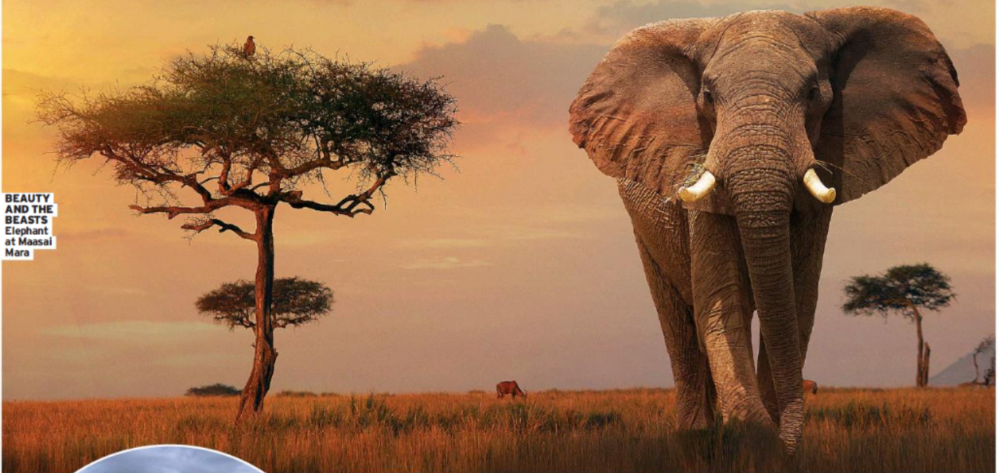
BEAUTY AND THE BEASTS Elephant at Maasai Mara