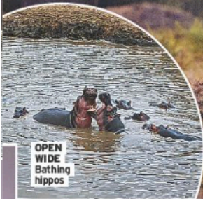
OPEN WIDE Bathing hippos