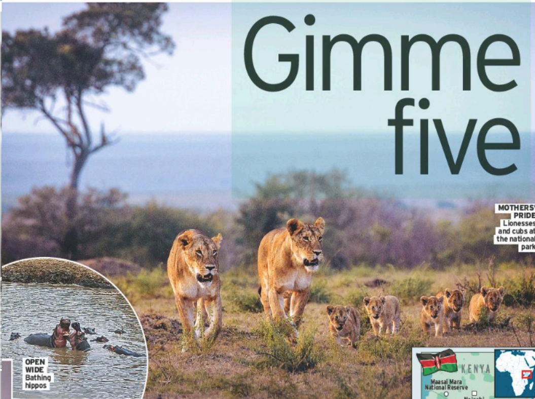
MOTHERS' PRIDE Lionesses and cubs at the national park