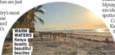
WARM WATERS Kenya boasts beautiful beaches

The town itself is bustling with nightlife options, with easy-going bars and restaurants. One night I ended up at a disco at a Diani Beach backpackers hostel and