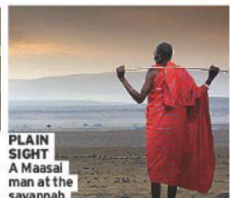
PLAIN SIGHT A Maasai man at the savannah