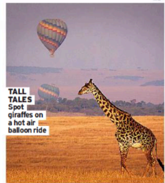
TALL TALES Spot giraffes on a hot air balloon ride

animal encounters, nothing beats a sundowner in the bush. Cold beers taste so much better when a wild giraffe ambles past. Then when the sun has set, you can bask in the glow of the campfire, gaze at the stars and listen to the tales of the Maasai.