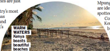
WARM WATERS Kenya boasts beautiful beaches

The town itself is bustling with nightlife options, with easy-going bars and restaurants. One night I ended up at a disco at a Diani Beach backpackers hostel and