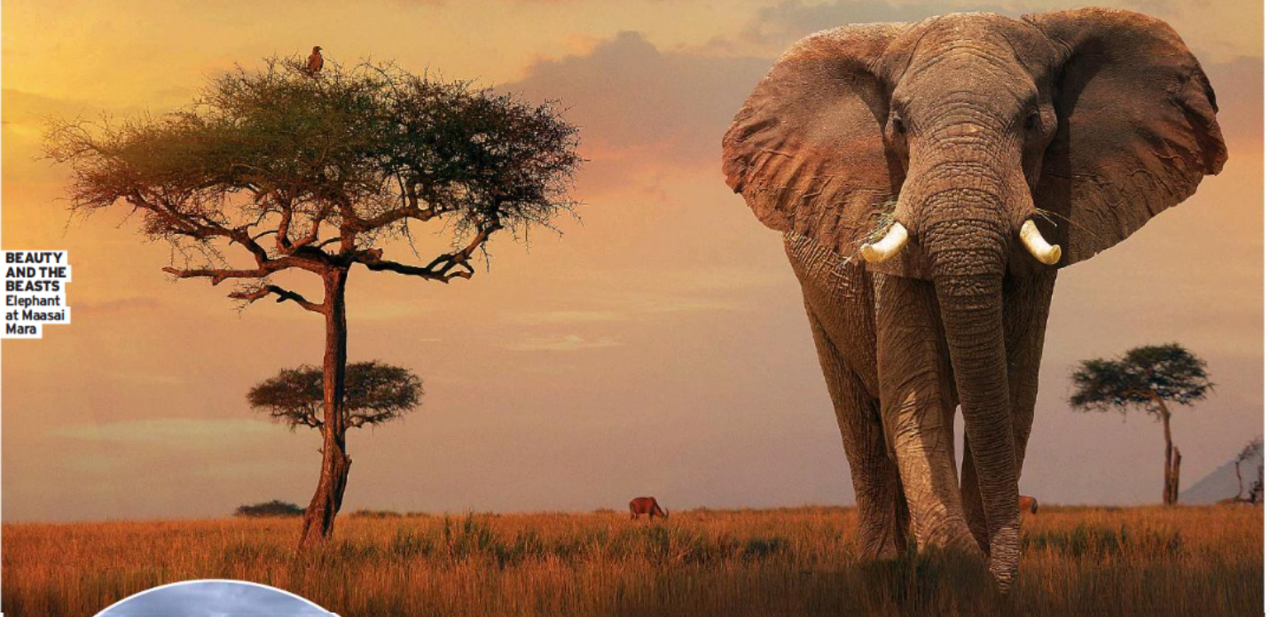
BEAUTY AND THE BEASTS Elephant at Maasai Mara