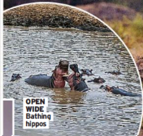
OPEN WIDE Bathing hippos